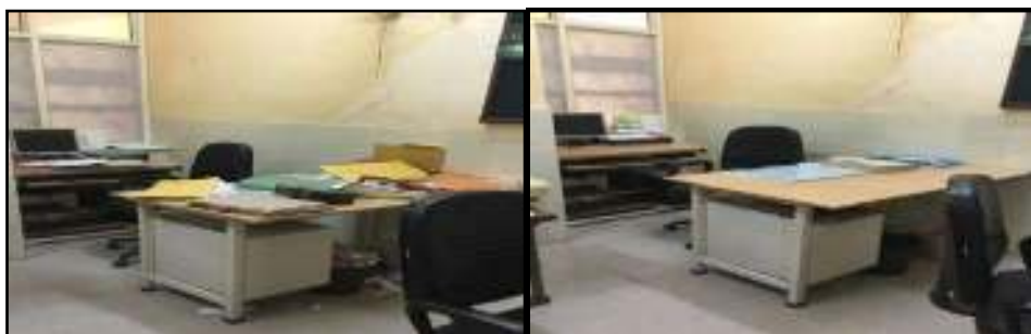
Initial picture of another corner of Office