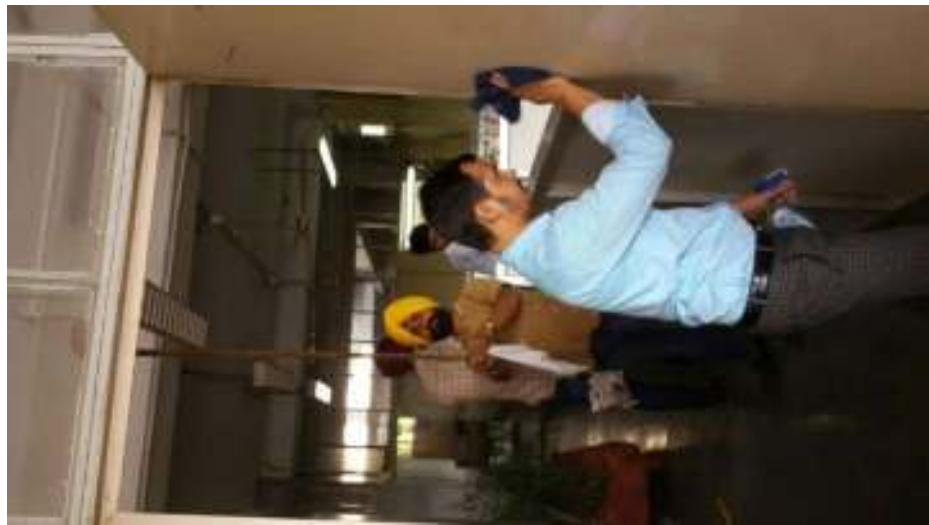
11. Swachhta Day on 29 th September 2017 at Office of A.R. (R & S)