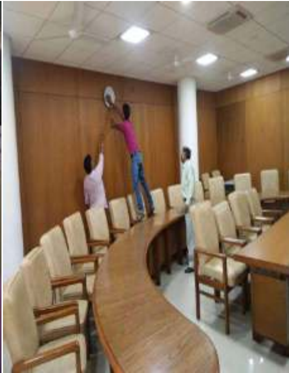
13. Swachhta Abhiyan performed at Computer Unit, Aruna Ranjit Chandra Hall and Dewan Anand Kumar Hall on 29 th September 2017 from 9.30 am to 10.30 am